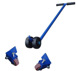
Mobility / Caster Kit