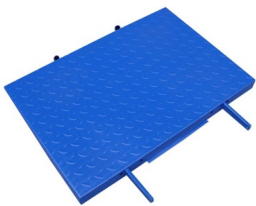
Trike / Chopper Extension