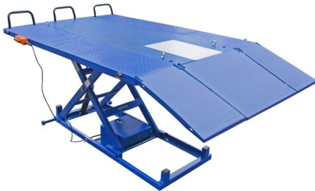
2200 Lb Electric