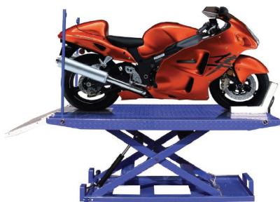
1500 Lb Hydraulic