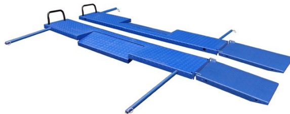
UTV Service Kit