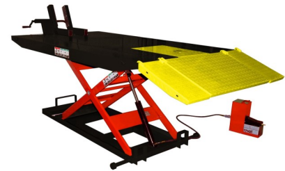
2000 Lb Hydraulic